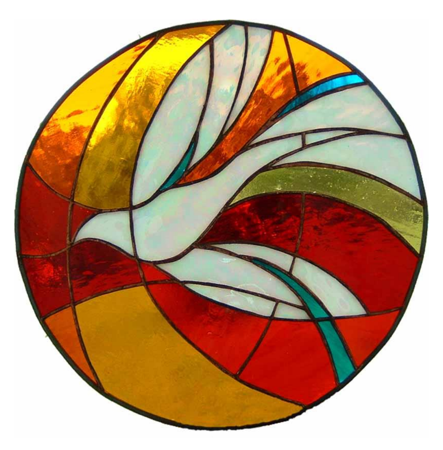
JUNE & JULY 2019 MAGAZINE