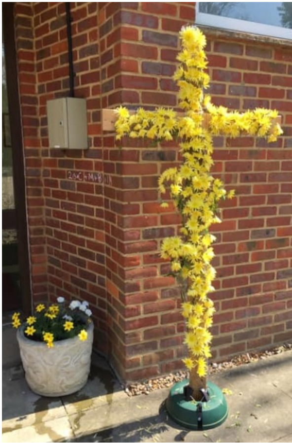
Homewood Road's beautifully decorated Easter Cross