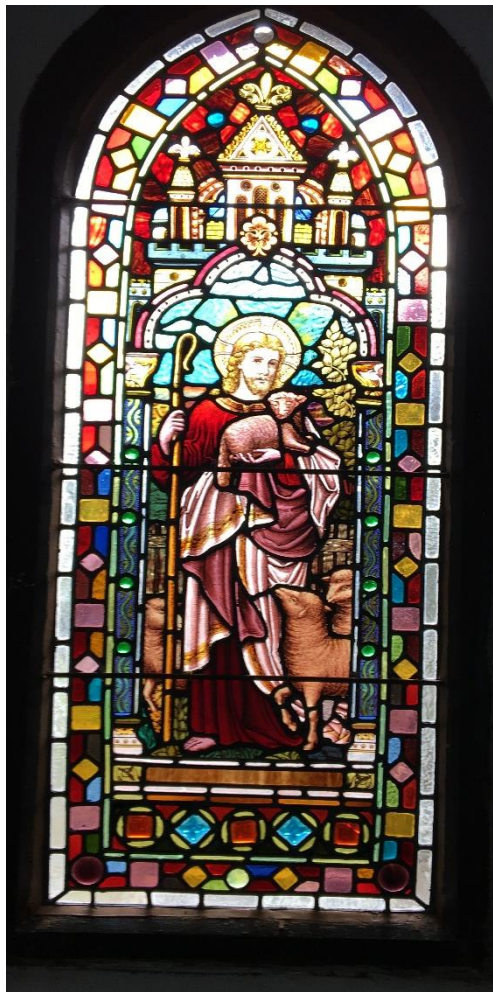
One of the newly restored windows

As Jackie has explained in the letter at the start of the magazine WUC like all churches is very busy with Lent and Easter activities at present. For us it is particularly poignant as last Palm Sunday we held our 'service' outside at the side of a local playing field – hardly daring to believe that we might be back in our own buildings later in the year.