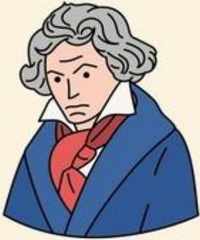
LUDWIG VAN BEETHOVEN