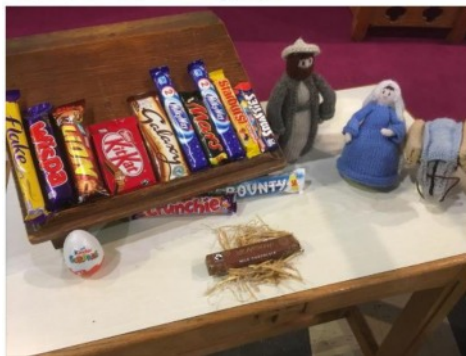
A very tasty Crib Service this evening at 4pm!

Homewood Road had a very chocolaty telling of the Christmas Story (so did Trinity at the Carol Tea but without the props!)