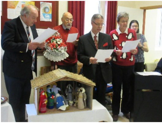
Edward Street, Dunstable